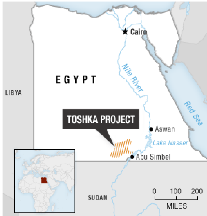
Figure 1. Egypt map showing Toshka area, Sheikh Zayed canal and Lake Nasser.

Toshka Project consists of a system of canals carrying water from Lake Nasser to irrigate the sandy wastes of the Western Desert of Egypt, which is part of Sahara Desert. The canal inlet starts from a site lying eight km to the north of Toshka Bay (Khor) on Lake Nasser. The canal is meant to continue westwards until it reaches Darb el-Arbe'ien route, then northwards along Darb el-Arbe'ien to Baris Oasis, covering a distance of about 310 km. The Mubarak Pumping Station in Toshka was inaugurated in March 2005 with a discharge of 300\text{m}^3/\text{sec} . It pumps water from Lake Nasser to be transported by way of a canal through the valley, with the idea of transforming about 550,000 feddans of desert into agricultural land.