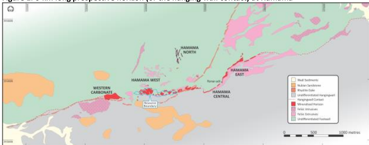
Figure 1. 6-km long prospective horizon (or the hanging wall contact) at Hamama